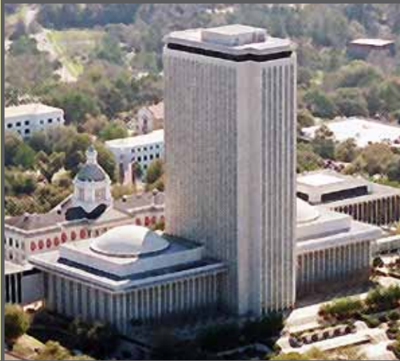
400 South Monroe Street • Tallahassee, Florida