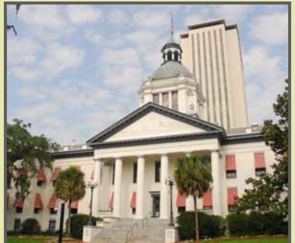
Florida's Historic Capitol

Restored to its 1902 version in 1982, The Historic Capitol includes the Governor's Suite, the Supreme Court, the House of Representatives and the Senate chambers, rotunda and halls. Its adapted space contains a museum with displays of the state's political history. The 1902 capitol building was the last statehouse in which all of Florida's political business was housed under one roof. A decade later, the Florida Supreme Court moved into its own facility west of the Capitol Complex.